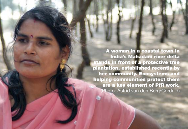
A woman in a coastal town in India's Mahadani river delta stands in front of a protective tree plantation, established recently by her community. Ecosystems and helping communities protect them are a key element of PfR work.