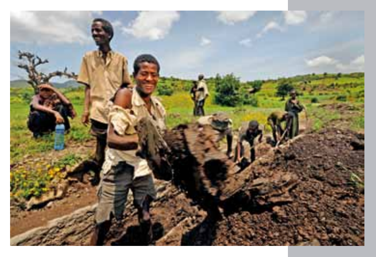
NETHERLANDS RED CROSS-SUPPORTED IRRIGATION WORK UNDERWAY IN NORTHERN ETHIOPIA IN 2011, NOW BEING CONTINUED AS PART OF NEW PFR WORK IN THE COUNTRY. THE PFR PROGRAMME IS ALREADY REDUCING DROUGHT IMPACT IN CERTAIN AREAS, THROUGH ACTIVITIES LIKE IMPROVED ACCESS TO SPRING WATER, SUSTAINABLE AGRICULTURE, VETERINARY SERVICES, AND CANAL MAINTENANCE.

The report cites evidence that climate change has led to changes in extremes such as heatwaves and heavy precipitation. In combination with social vulnerabilities and exposure to risks, this produces climate-related disasters; but the report also argued that policies "to avoid, prepare for, respond to and recover from the risks of disaster can reduce the impact of these events and increase the resilience of people exposed to [them]".