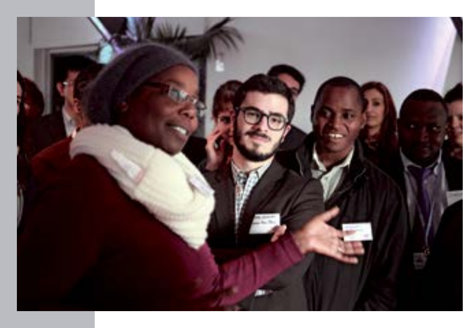
Participants at a games workshop at the Development and Climate Days side-event at COP 21 in Paris who played Answer with your feet — a quick energizer that allows players in a room to organize according to called-out questions.

Much of the preparatory work for the diplomacy at the UN conferences in Sendai and COP 21 in Paris was based on outcomes of this CDKN-supported project, including case studies and booklets produced at writeshops and a paper on the Minimum Standards for the Global Assessment Report of the UN Office for Disaster Risk Reduction (UNISDR), as well as the work of PfR alliance members on engagement at Sendai, where the Climate Centre and our PfR colleagues helped keep a focus on climate risk management as part of the global agreement.