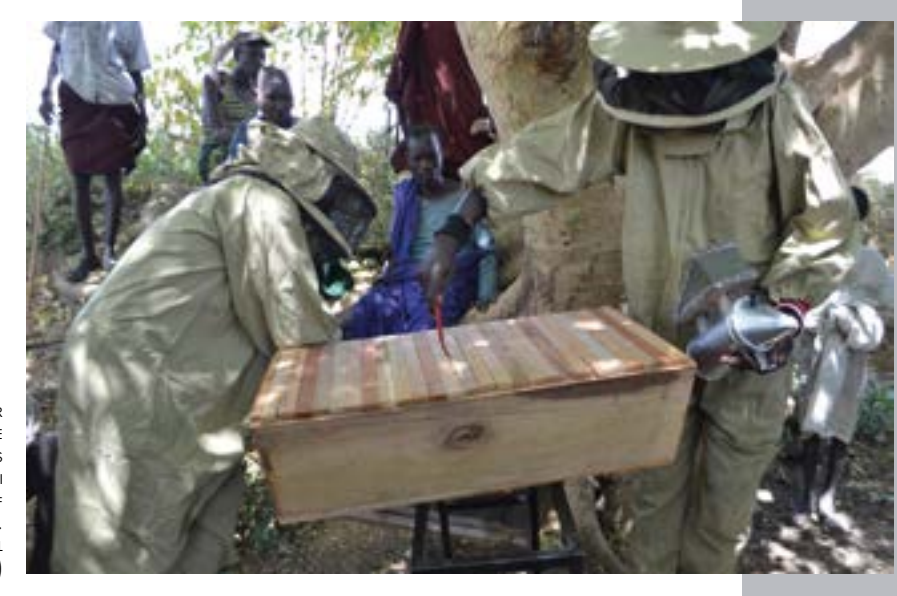
Ugandan bee-keepers practice their skills as part of the PfR programme in the country. Their experience was detailed in a case study at a Nairobi writeshop that documented five years of work in Ethiopia, Kenya and Uganda.

Bee-keeping ( photo ) is one of several diversification projects supported by PfR in Uganda, along with seeds that resist drought and mature early, vegetable cultivation and goatrearing. Energy-saving stoves and tree nurseries helped roll back ecosystem damage from charcoal burning.