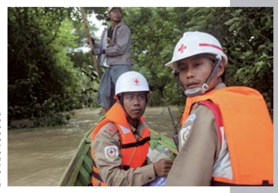
EMERGENCY RESPONSE TEAMS FROM THE MYANMAR RED CROSS EVACUATING FAMILIES AND PROVIDING RELIEF AND MEDICAL ASSISTANCE TO COMMUNITIES AFFECTED BY SEVERE MONSOON FLOODS AND LANDSLIDES. ASIA WAS BY FAR THE WORST-AFFECTED CONTINENT IN TERMS OF CLIMATE-RELATED DISASTER IMPACTS IN 2015.

We worked with the American Red Cross to network communities, civil society, and government agencies, helping to scale up tools and educational games that enhance decision-making in hard-to-reach locations.