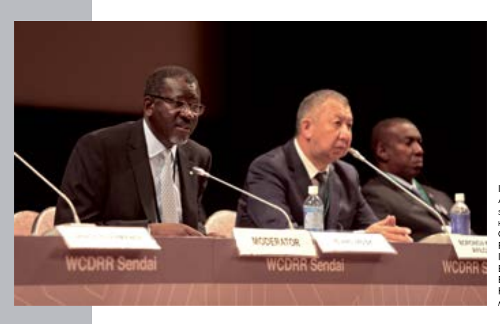
IFRC SECRETARY GENERAL ELHADJ AS SY MODERATES A SPECIAL SESSION ON TECHNOLOGICAL HAZARDS AT THE THIRD UN WORLD CONFERENCE ON DISASTER RISK REDUCTION AT SENDAI, WHERE THE IFRC FORMALLY LAUNCHED THE ONE BILLION COAUTION. ON HIS LEFT IS BORONOV KUBATBEK AYILCHIEVICH, KYRGYZTAN'S EMERGENCIES MINISTER.

With Climate Week running in parallel with that summit, Mr Sy noted that there were now an estimated 250 million people in the world affected by humanitarian crises, adding that: "We are seeing an increase in the intensity, frequency and unpredictability of disasters, often as a result of climate change and unplanned urbanization." The Red Cross Red Crescent was uniquely well placed to drive "meaningful and sustainable changes at the community level by building and strengthening resilience".