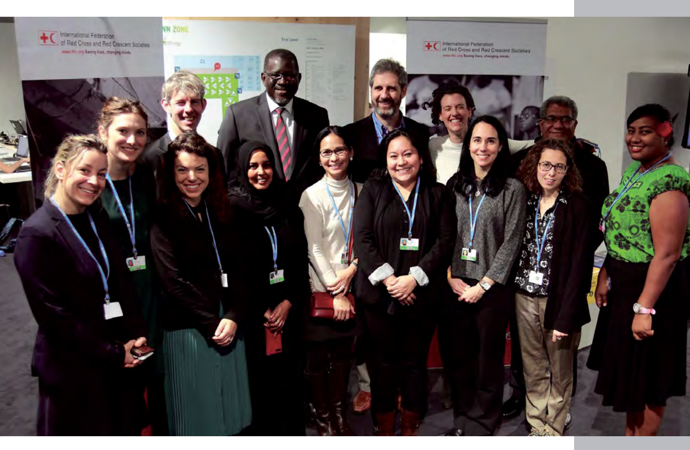
IFRC stand, COP 23, Bonn, November 2017