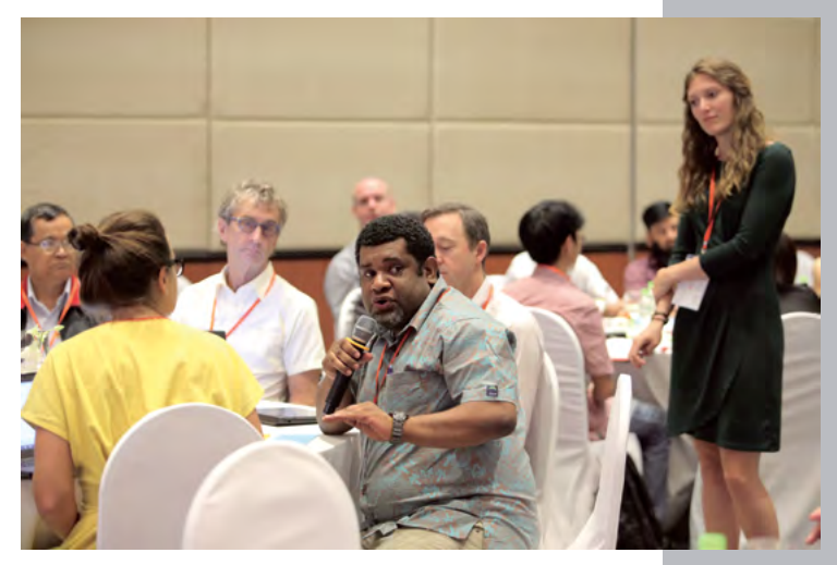
First FbF dialogue platform in Asia, Hanoi, June 2017

In the academic arena, the UK's Department for International Development (DFID) funded two projects – 'Towards Forecast-based Preparedness Action' and 'Forecasts for Anticipatory Humanitarian Action' – generating case studies on FbF in Mozambique and Uganda, and Kenya's system for drought warning.