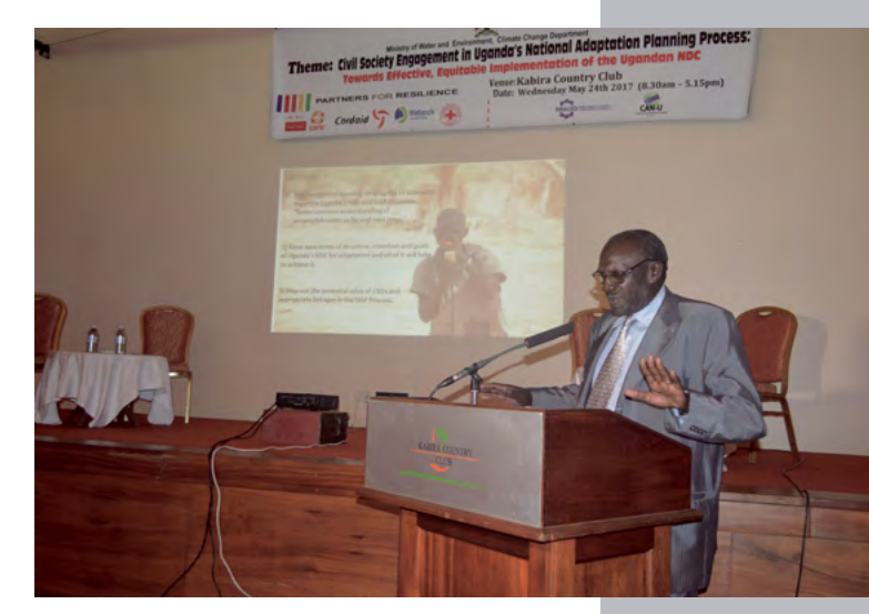
PfR-supported adaptation workshop for Uganda, Kampala, May 2017

- Sam Cheptoris, Ugandan Minister of Water and Environment (PfRsupported adaptation workshop)