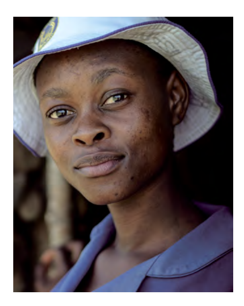
Red Cross protective assistance to children, Mafateng district, Lesotho, January 2018

In collaboration with the UN Food and Agriculture Organization (FAO) we created a game on bringing a resilience lens to social protection and humanitarian aid. We expanded our networks and collaborated with National Societies and other partners, including risk financing and insurance concerns.