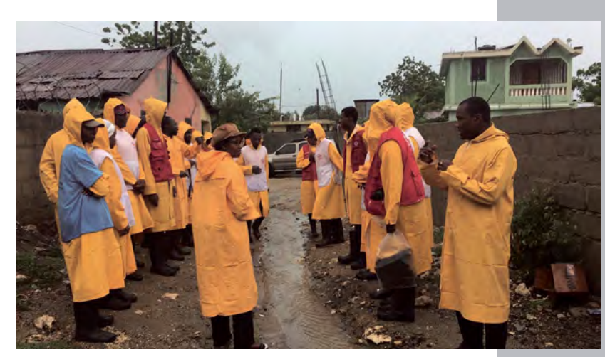
Haiti Red Cross volunteers, Hurricane Irma, September 2017

"This underscores the key humanitarian message, that we must keep up the pressure to act earlier, be more agile, and advocate for more flexible funding in fragile, conflict-affected countries."