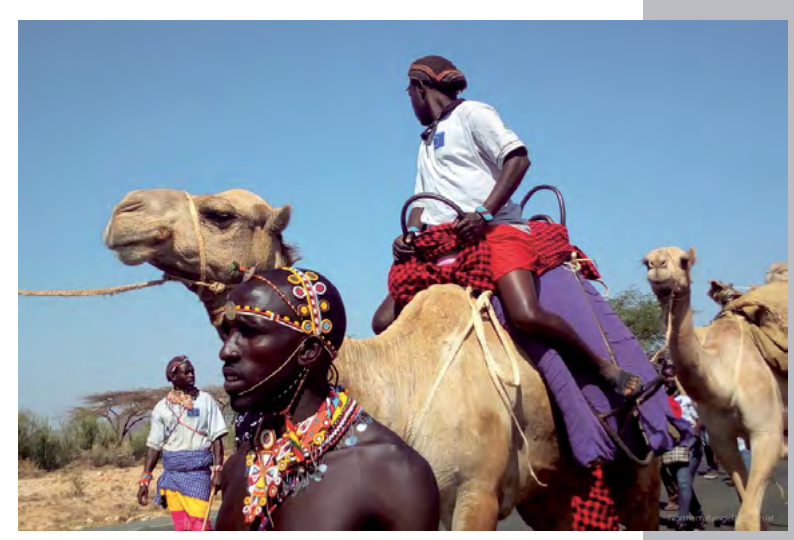
PfR camel caravan, Ewaso Ngiro basin communities, Kenya, September 2017

And in Uganda substantial progress was made with PfR contributing to the climate change bill and <u>national adaptation planning</u> (see below), while the government also committed itself to setting up a fund for early warning early action.