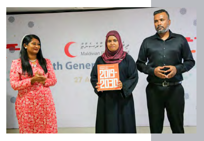
Long-term priority #1 for the Maldivian Red Crescent? <u>The climate threat</u>

The Covid-19 crisis and ensuing stimulus recovery packages that will amount to over US$ 10 trillion represent the best and perhaps last opportunity to redesign social and economic systems so they better meet the needs of the most vulnerable, protect nature, strengthen global solidarity, and align with global climate goals.