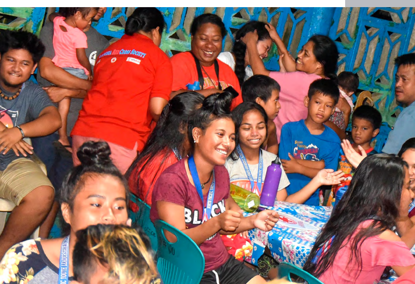
First North Pacific youth leadership supercamp and Y-Adapt training, Pohnpei, Micronesia

With increasing global demand for Y-Adapt a peer-to-peer approach was trialled at the <u>first-ever youth leadership supercamp</u> in Pohnpei, Micronesia, facilitated by the Philippine Red Cross.