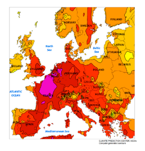
July 2019 heatwave mapped by US Climate Prediction Centre (purple areas >40°C)

Climate change had "clearly led to increased precipitation during extreme events in south-east Texas," said the WWA group, who also wrote in a <u>blog</u> that air pollution that blocked sunlight and increasing irrigation were among an array of factors masking a clear upward trend in extreme temperatures in India.