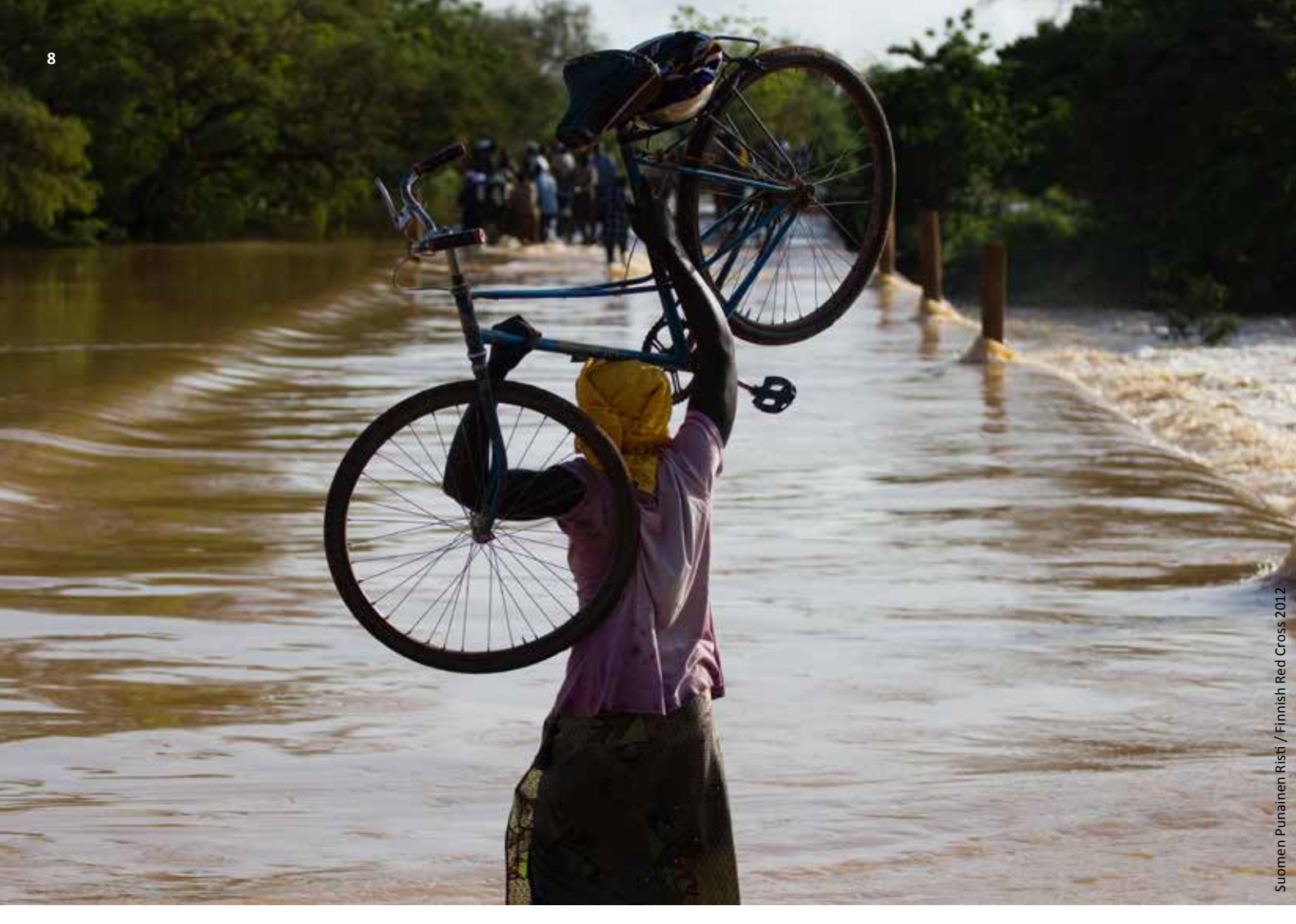
In the Sahel region the rainy season starts towards the end of the summer. Often the ground is so dry that it can't absorbe the water and local flooding occur. Climate change has made the rains erratic and farming and life in general is often plagued by to little or too much rain.