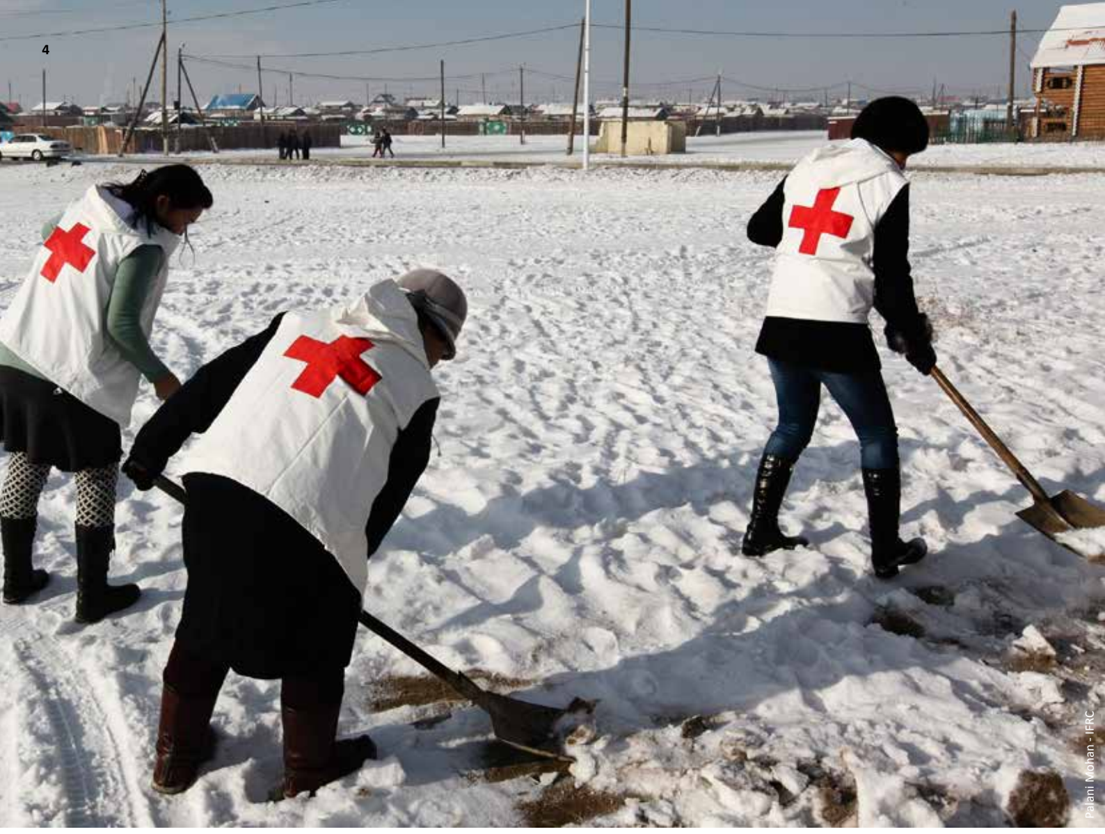
Heavy rainfall and "dzud" events are projected to increase in Mongolia due to climate change.