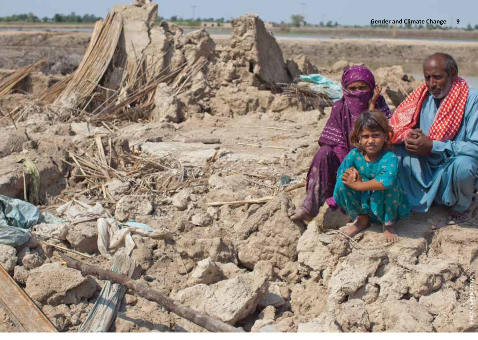
This Pakistani family sit in front of the remains of their house after severe floods.