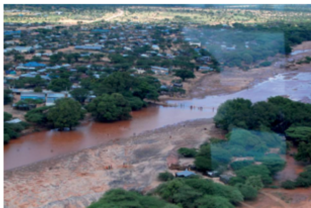
2015 Mogodashe floods in Garrisa County, Kenya

False alarms do, however, appear to impact trust in forecasts at the community level (2). Several informants relayed stories suggesting that the 2014 forecasts eroded trust at the community level. In Kenya for instance, belief that the 2014 El Niño forecast had been inaccurate, led some villagers to “dispute [the 2015 El Niño forecast] ... quoting the earlier ‘forecast’ of the previous year when we were told ‘El Niño is coming,’ and then it never came” (2). For individuals, the implications of acting in vain are potentially much greater than for organizations, and as the result of predictions that do not materialise, individuals appear quick to conclude that “because [El Niño] didn’t happen after the last two [forecasts], we’re not going to rely on this information anymore” (2).