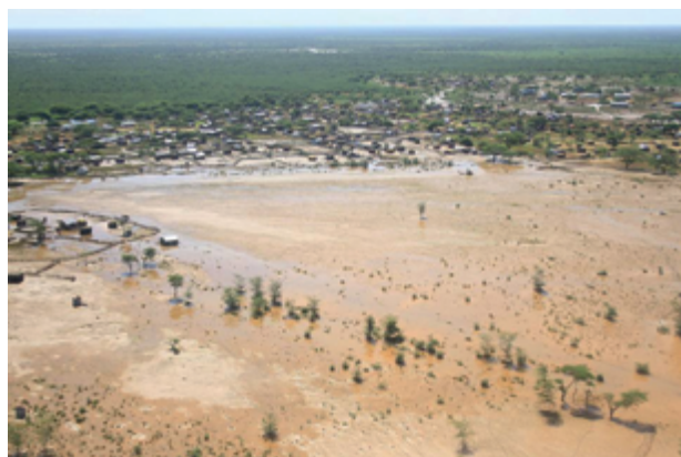
An aerial photo of Modogashe Garissa County during El Niño season 2015

In Kenya, previous experience with El Niño appears to have motivated both the government and the broader humanitarian community to plan. Despite some confusion regarding devolution policies, actors appear to have worked well, under government supervision, to coordinate their response. Actors believed that good coordination and collaboration was essential to planning a unified response. In the end, the flooding was not as bad as anticipated (or, at least, not as bad as 1997–1998), but actors were prepared to respond when the flooding arrived. KRCS was also one of the only organizations across all five countries to use forecasts to mobilise funds to help farmers take advantage of increased rains. Although evaluation of the project was a challenge, it appears to have been successful.