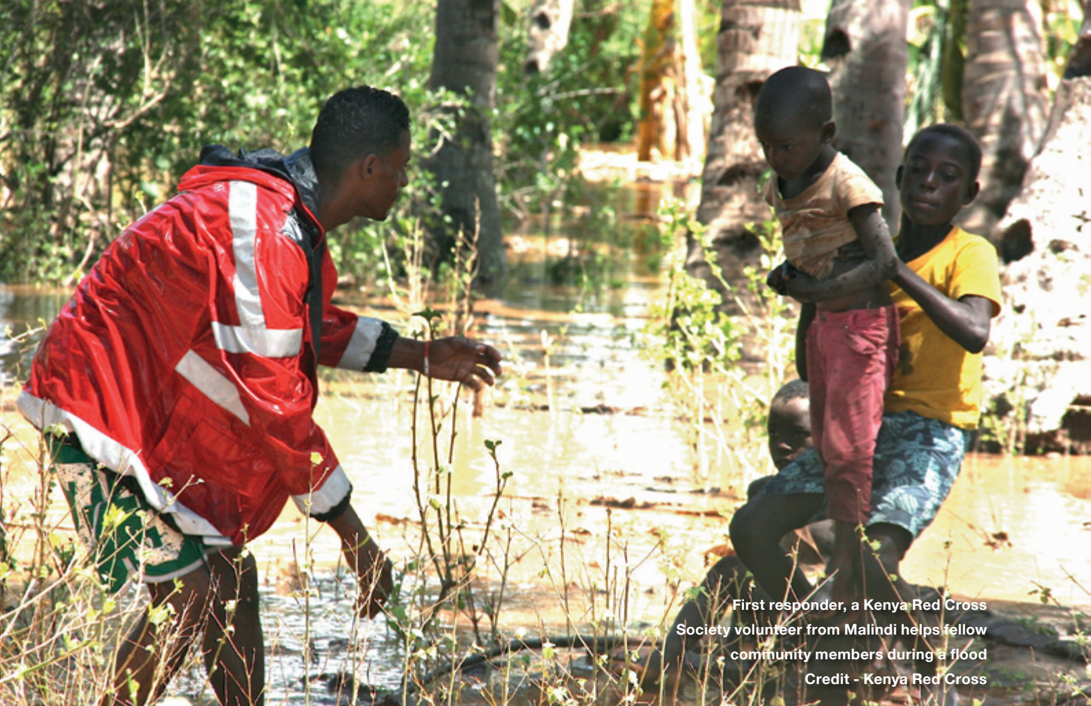
First responder, a Kenya Red Cross Society volunteer from Malindi helps fellow community members during a flood