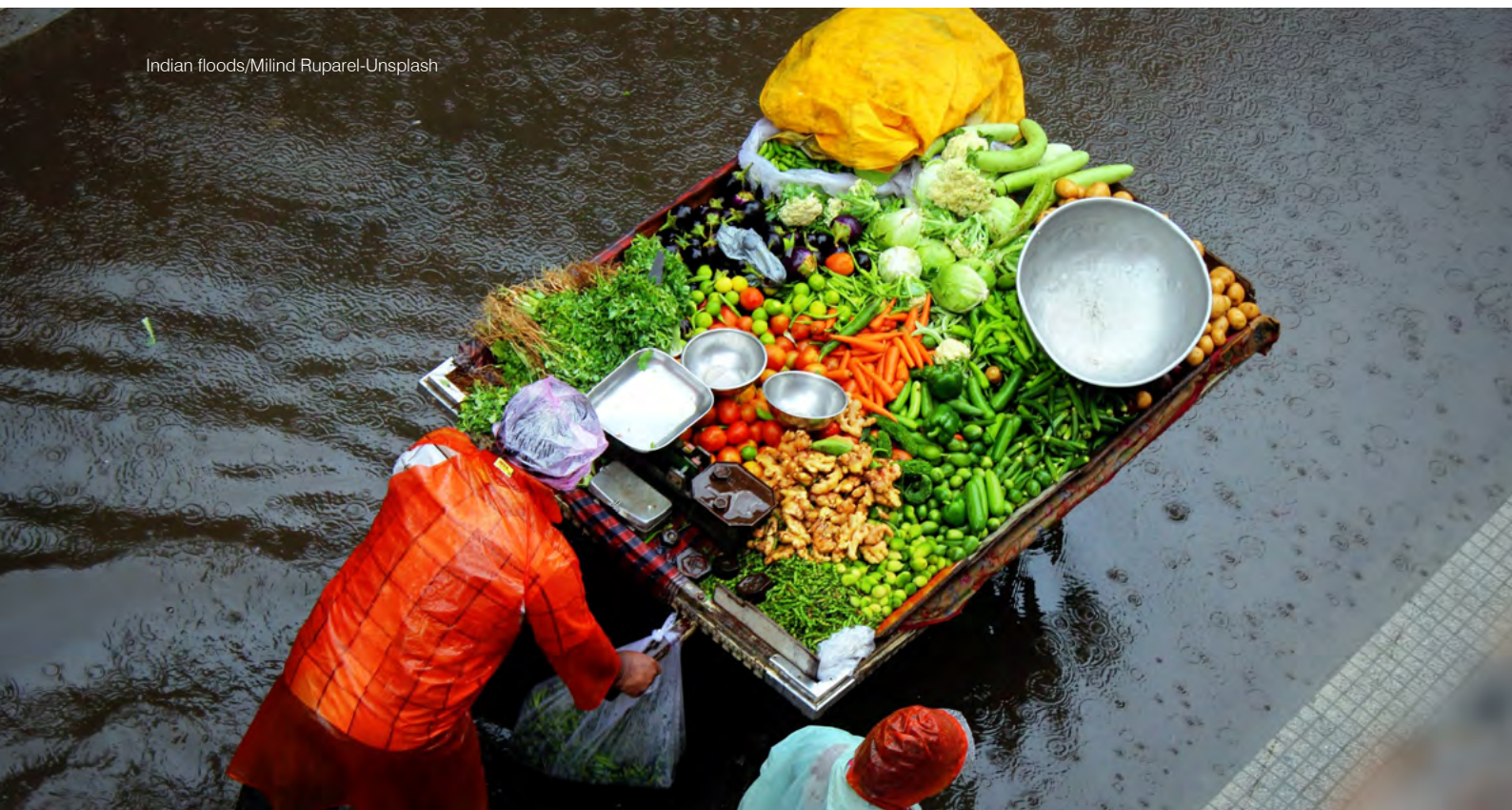
Indian floods

These hazards have direct consequences on the lives and livelihoods of people in urban areas. Increased poverty and homelessness, unemployment and loss of income opportunities, food insecurity and health risks are a few of the most serious impacts that can arise from these hazards. More variability and the greater likelihood of extreme events – for example, flooding, sea level rise, heatwaves and drought present new threats which, together with rapid and unplanned urbanization, present the potential for risks – often impact the poorest people disproportionately; many of whom live in