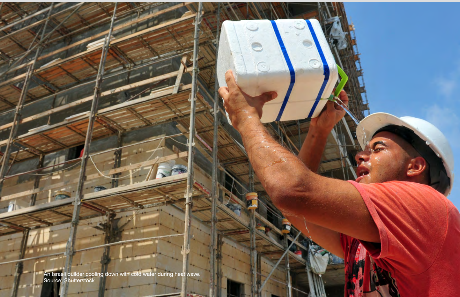
An Israeli builder cooling down with cold water during heat wave.