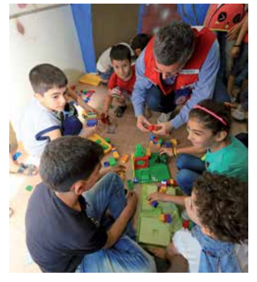
Volunteers play with a group of children at the psychosocial centre in Dweila, Syria.