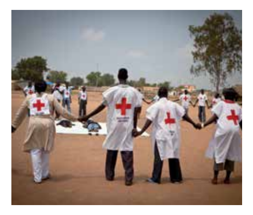
South Sudan Red Cross volunteers take part in a training in preparation for the independence celebrations.

The Reference Centre on Volunteering develops, promotes, facilitates and manages knowledge on volunteer management and volunteering development in Europe.