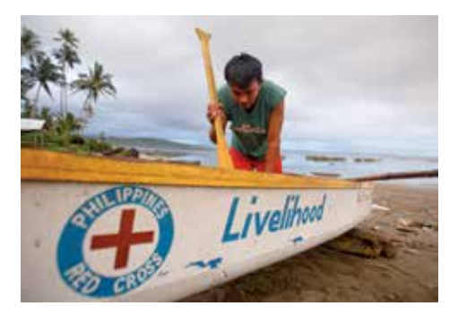
A resident prepares his boat before sailing to fish with the help of the Philippine Red Cross livelihood assistance project after Typhoon Bopha.

The Livelihoods Resource Centre (LRC) spreads awareness of effective livelihoods programming strategies, and helps IFRC members to enhance community capacity and individual skills, restore and sustain sustainable livelihoods, and thereby establish more secure living conditions. The LRC is also a network of community-based livelihood experts, who can pass on knowledge, develop methodologies and policies, build capacity, and provide technical assistance.