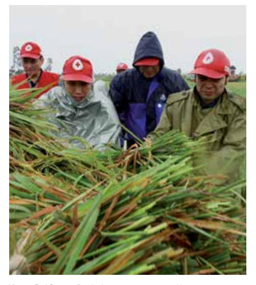
Vietnam Red Cross staff and volunteers support communities on the coast to bring in their rice harvests ahead of a typhoon.

The Climate Centre supports the Red Cross and Red Crescent Movement and its partners in reducing the impacts of climate change and extreme weather events on vulnerable people.