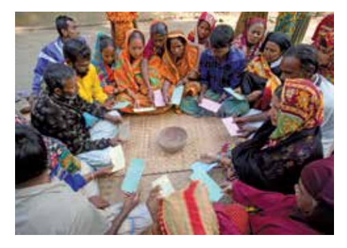
Residents practice using a participatory tool that allows communities to improve their living environment, build safer shelters and design better settlements.

The Global Disaster Preparedness Centre (GDPC) helps to enhance the disaster preparedness capacities of Red Cross and Red Crescent national societies and the wider humanitarian community. It provides specific network-wide services in response to national and community demands for tools and learning on disaster preparedness and resilience.